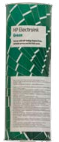
Series 3 ink cartridge

In addition, every month, more than 100 tons of HP Indigo prints produced with HP Indigo ElectroInk in HP Indigo facilities are collected and sold for a variety of recycling applications.