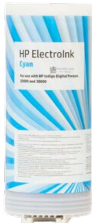
New generation ink tube made from recycled plastic

As a result of the new feature, the amount of oil waste is reduced, contributing to a smaller environmental footprint associated with use of this product.